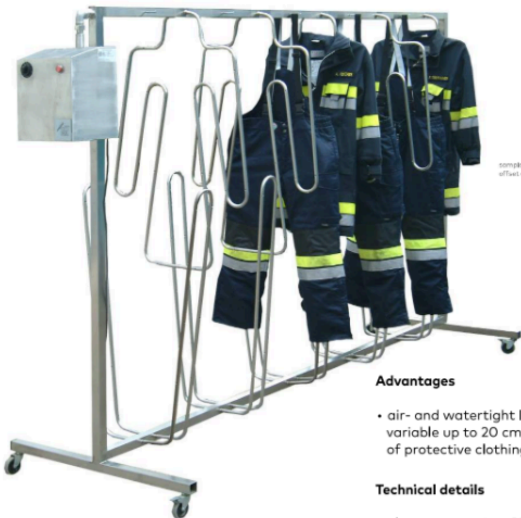
sample picture: OSMA Fireman for 3 jackets and trousers offset arrangement for jackets and trousers